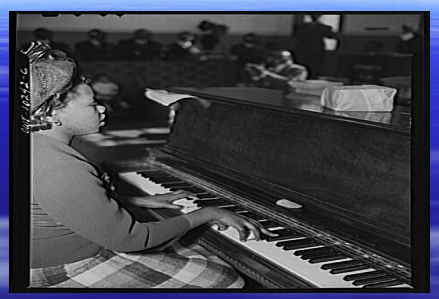
OBSERVE, REFLECT, QUESTION